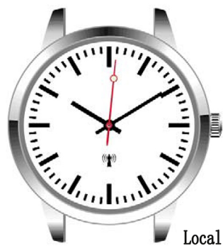
Local time zone indicating position